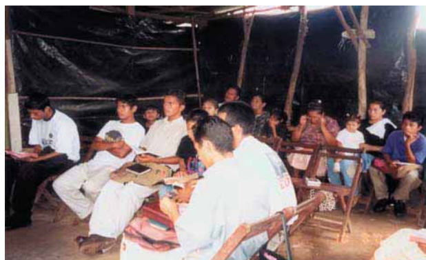
The Congregation in Diriamba-Jinotepe (Pictured above is the church building and some of the congregation.)