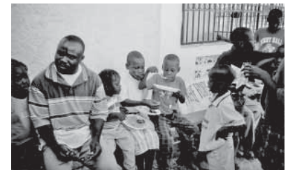
A meal was prepared for over 100 needy children. Food items were also distributed to the members of the new congregation.

We give thanks to God for this work and pray his blessings and guidance as this new congregation grows in the grace and knowledge of Jesus Christ.